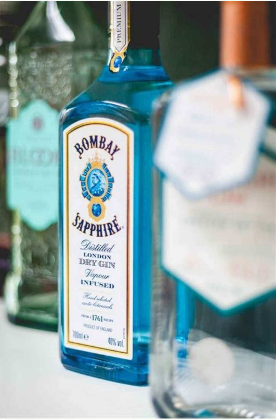
The bartender's book.